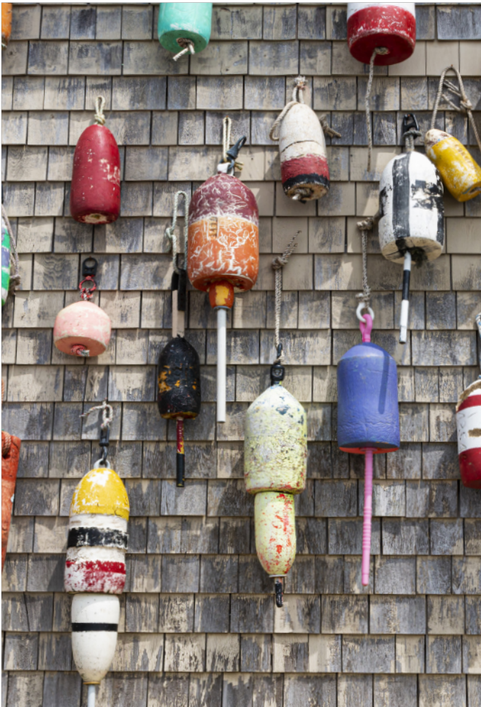
IMAGES OF THE SCARBOROUGH, ME SURROUNDING AREA