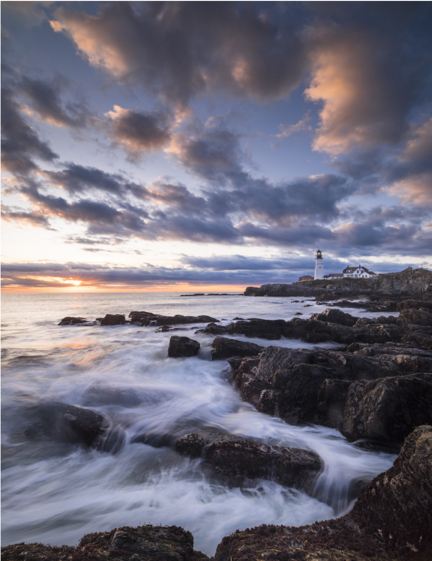
IMAGES OF THE SCARBOROUGH, ME SURROUNDING AREA